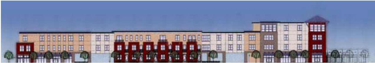
East Lake Street Elevation