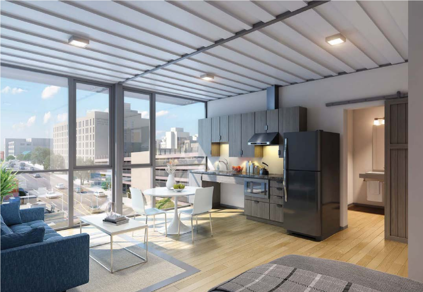
HOPE ON ALVARADO