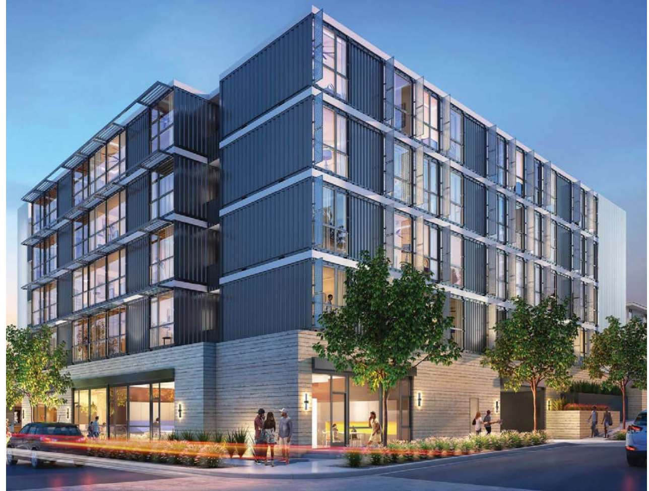
HOPE ON ALVARADO